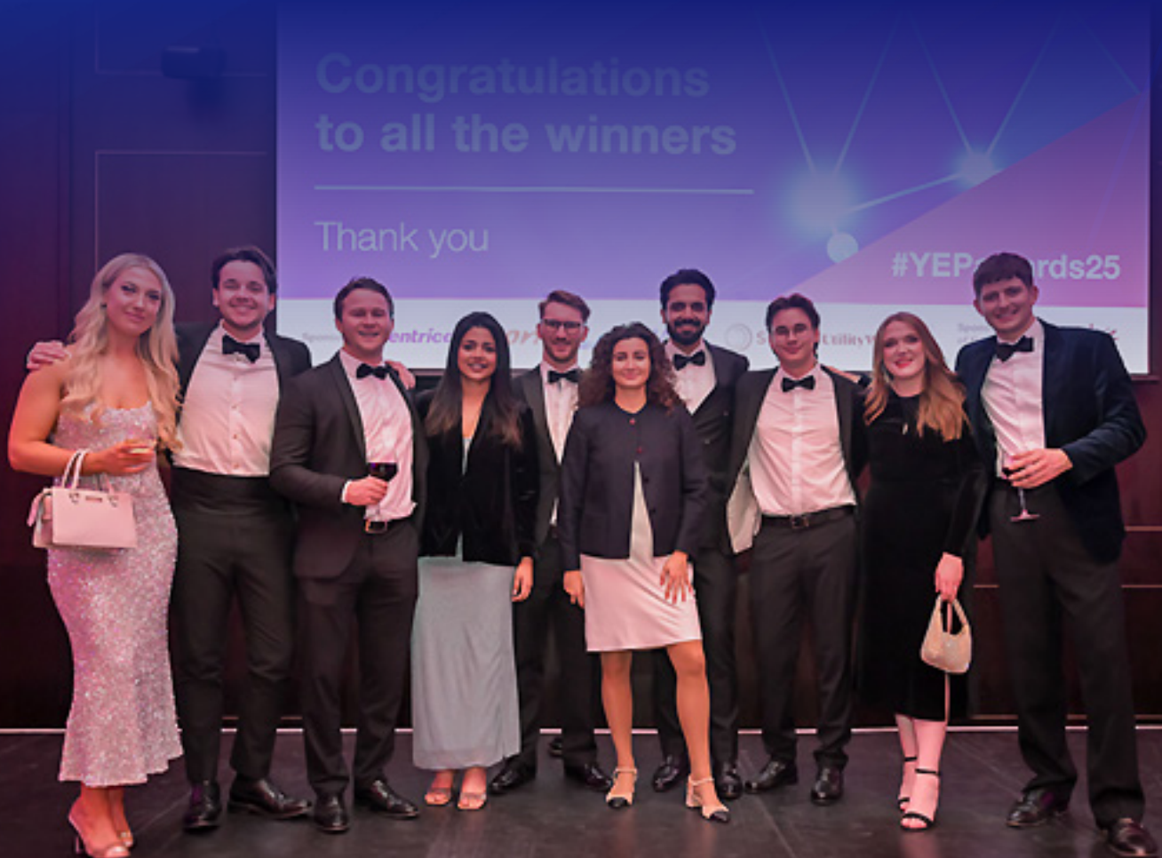
Our Steering Committee at the 2025 YEP Awards